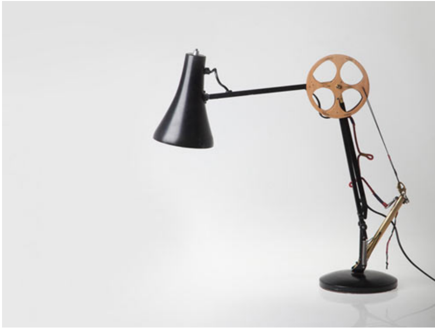
Repaired Anglepoise (http://www.paulogoldstein.com/Repaired-Anglepoise)