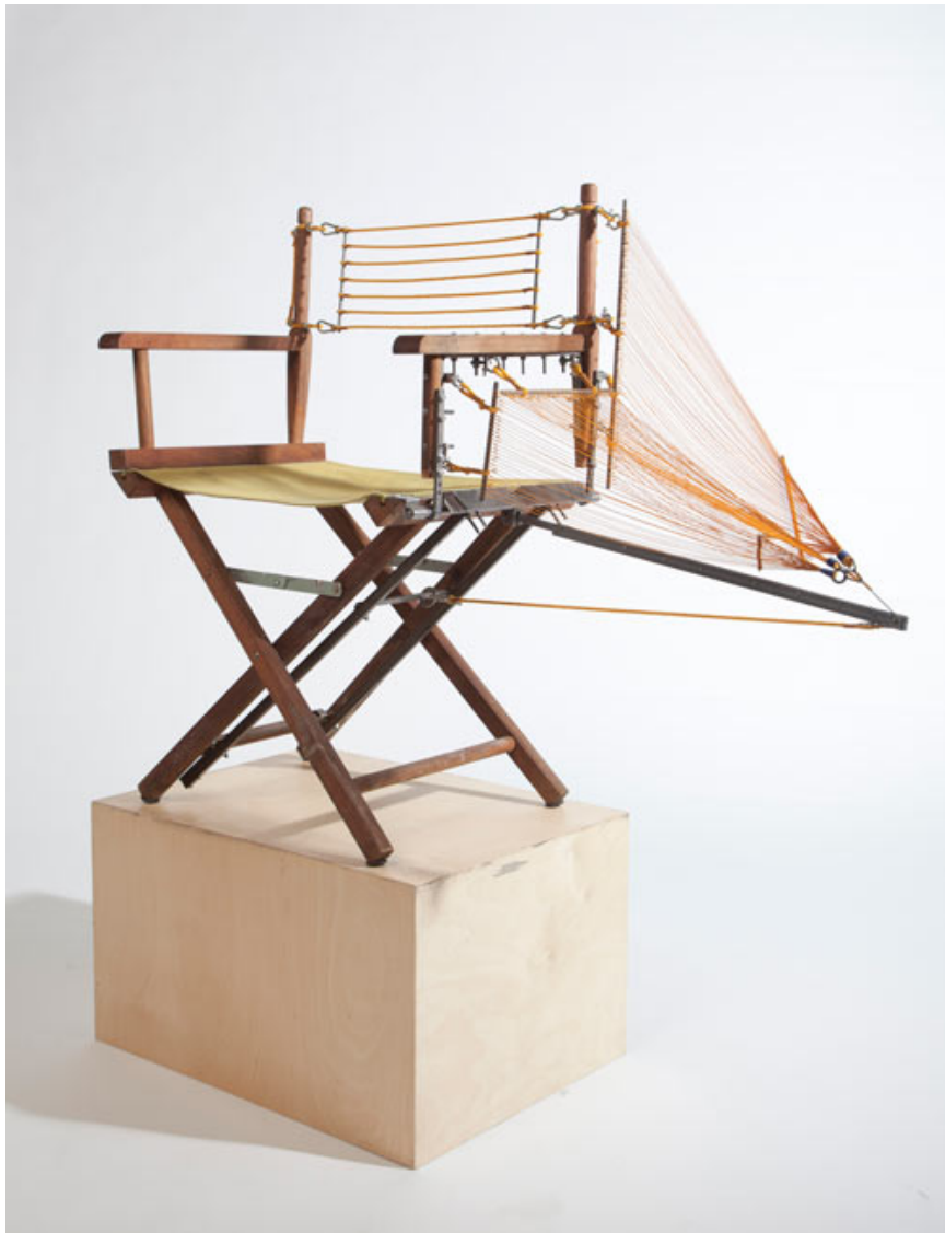
Repaired Director's Chair ( http://www.paulogoldstein.com/Repaired-Chair )