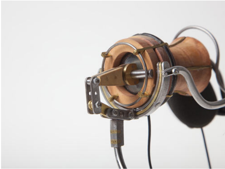
Repaired Headphone ( http://www.paulogoldstein.com/Repaired-Headphones )