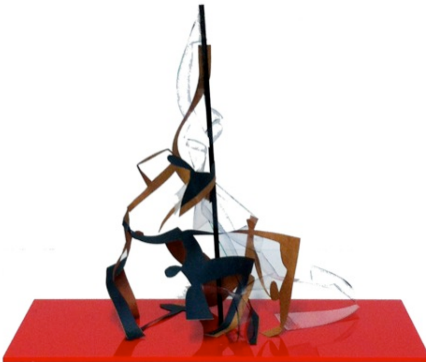
Love Garden sculpture by Hormazd Narielwalla

By Angus Montgomery May 7, 2013 11:33 am