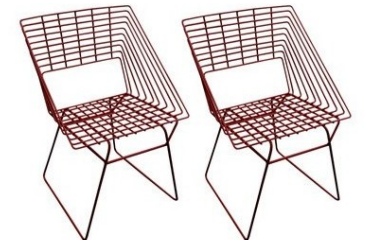
DED METAL CHAIDS (HTTD-//DESIGN_MILK COM/DED_METAL_CHAIDS/)