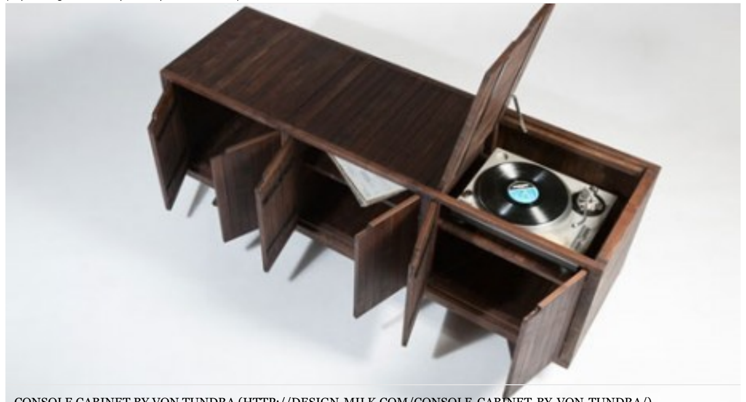
BY VON TUNDRA (HTTP://DESIGN-MILK.COM/CONSOLE-CABINET-BY-VON-TUNDRA/)