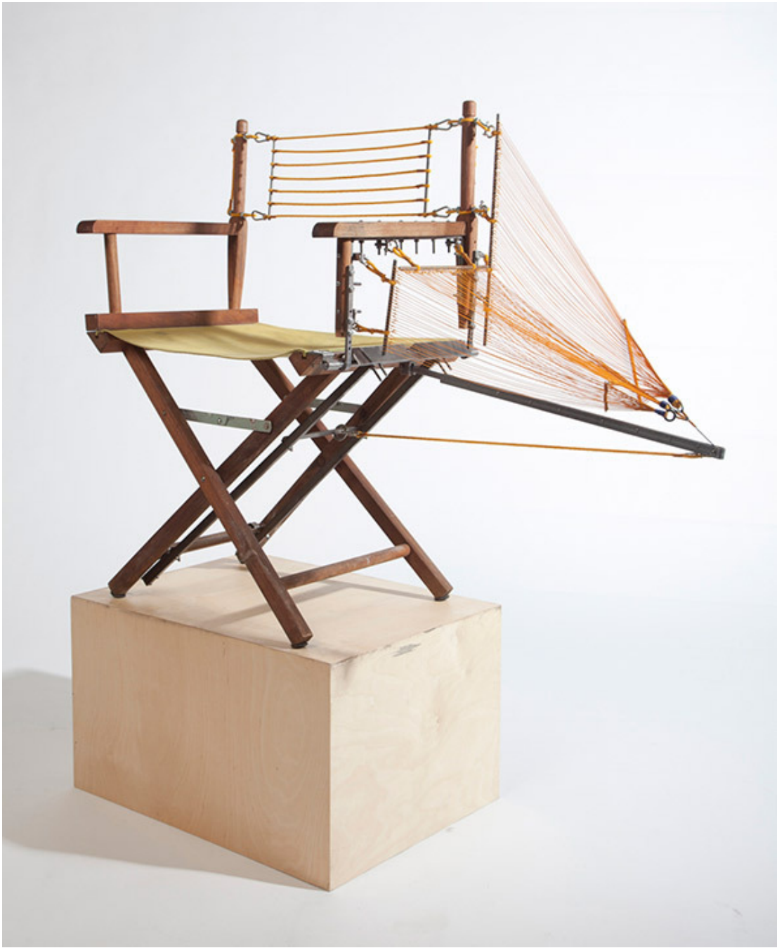
Paulo Goldstein: Repair Is Beautiful