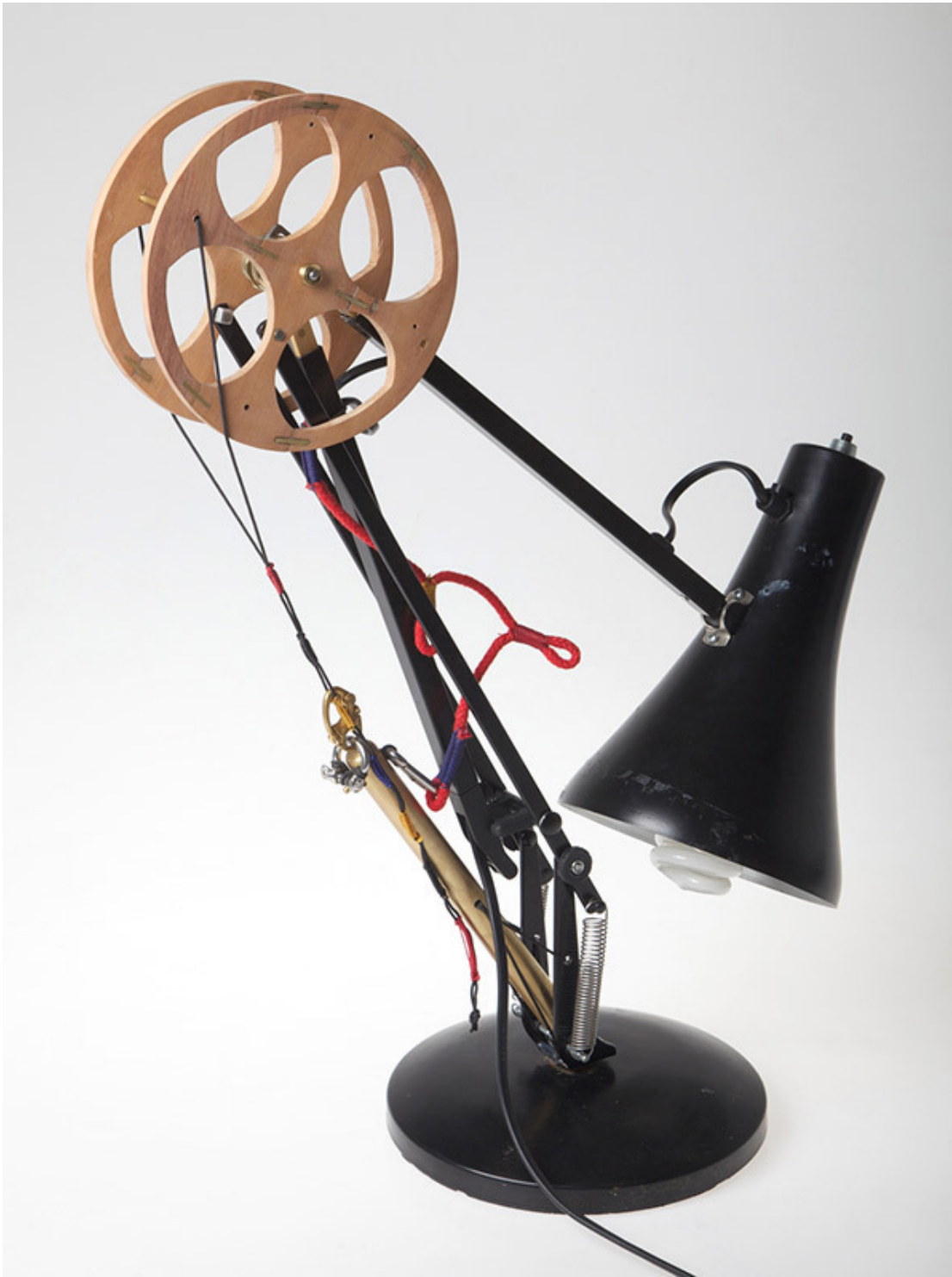
Paulo Goldstein: Repair Is Beautiful